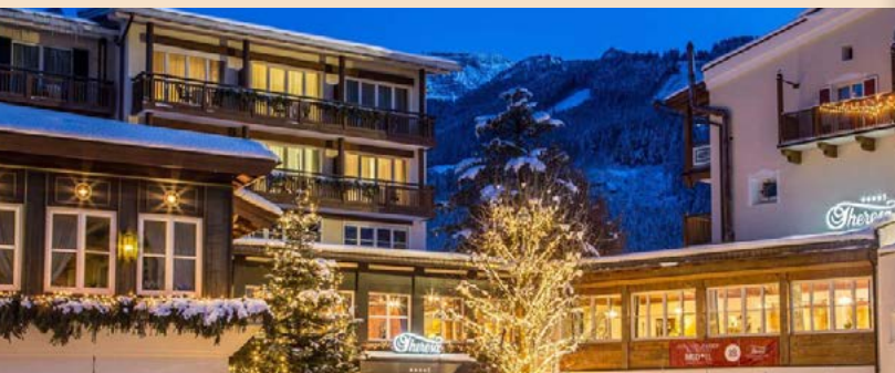
Hotel Theresa in Zell im Zillertal, Austria

Registration will begin on Saturday, March 21st, with final talks given on Friday, March 27th.