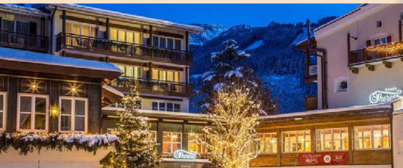
Hotel Theresa in Zell im Zillertal, Austria

Registration will begin on Saturday, March 21st, with final talks given on Friday, March 27th.